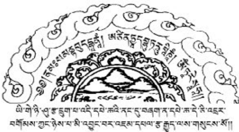
For Non-Commercial Use Only