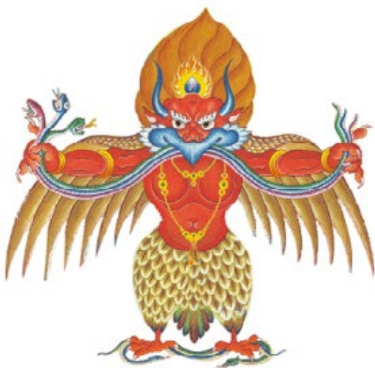
Cover Design by Wang Punkway